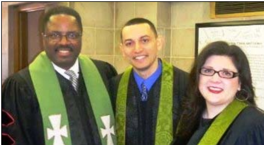
Worship Leaders from Sunday, January 31, 2010